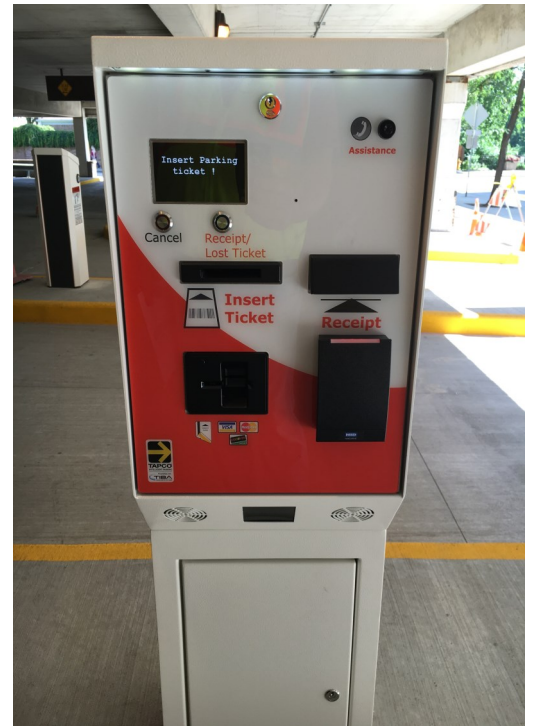
New credit card pay station in the Red Ramp. Similar machines will be installed in the Green and Yellow ramps later this summer.